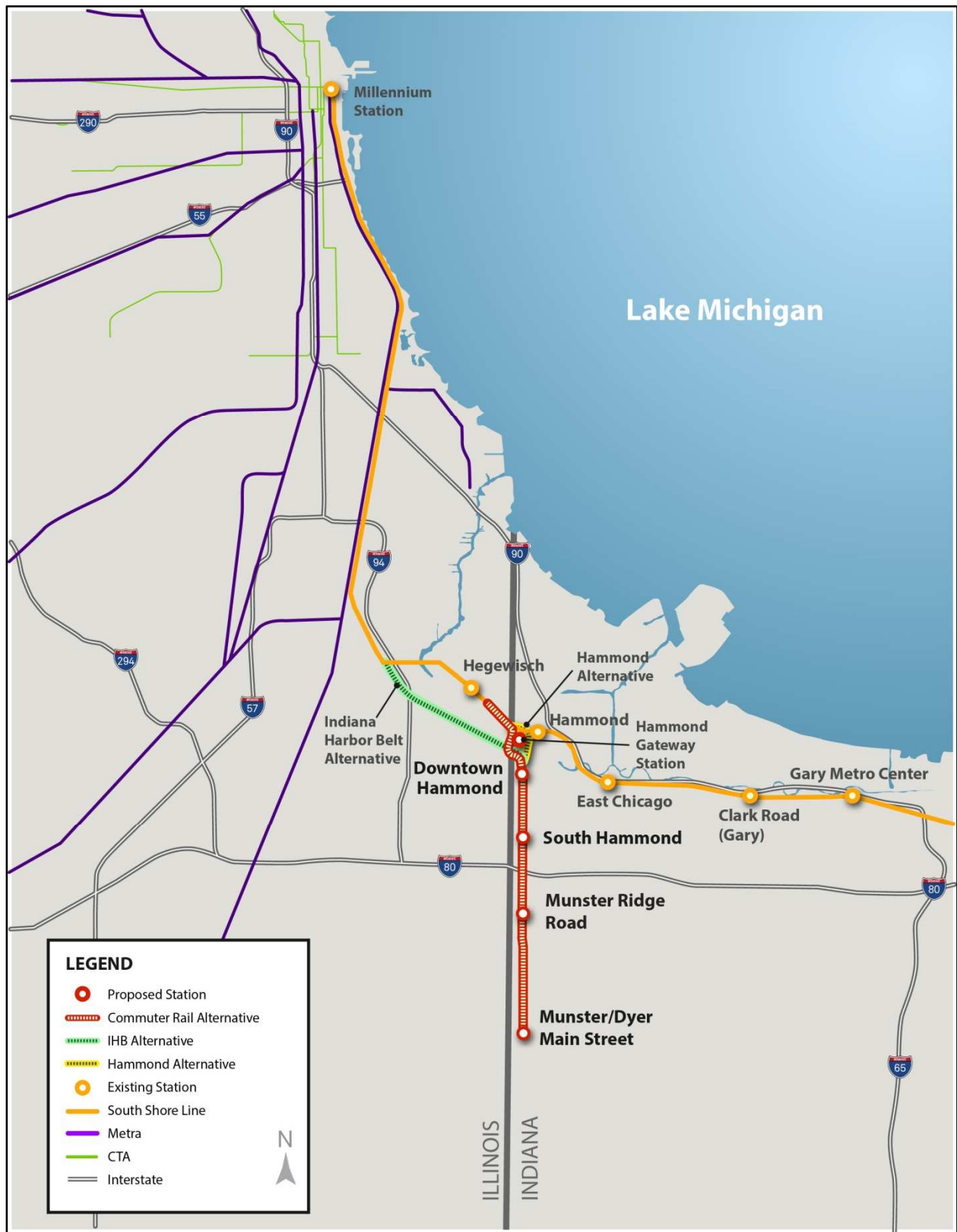
Figure 1: Regional Setting for West Lake Corridor Project